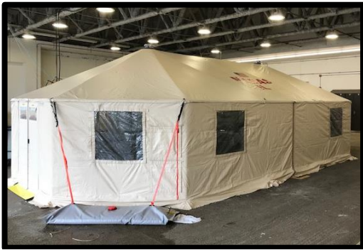
Division 14 Western Shelter set up at Copley-Rush Hospital