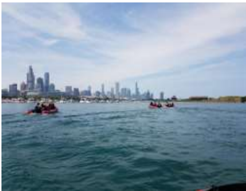
Training with Chicago in Chicago !!