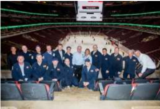
MABAS was invited to the Black Hawks Training Session