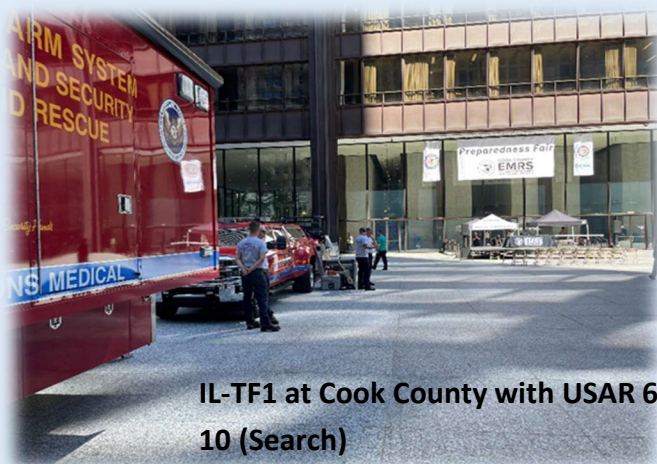
IL-TF1 at Cook County with USAR 6 Medical and USAR 10 (Search)