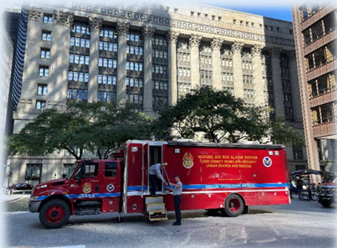
August Drill—Base Camp & Cache updates